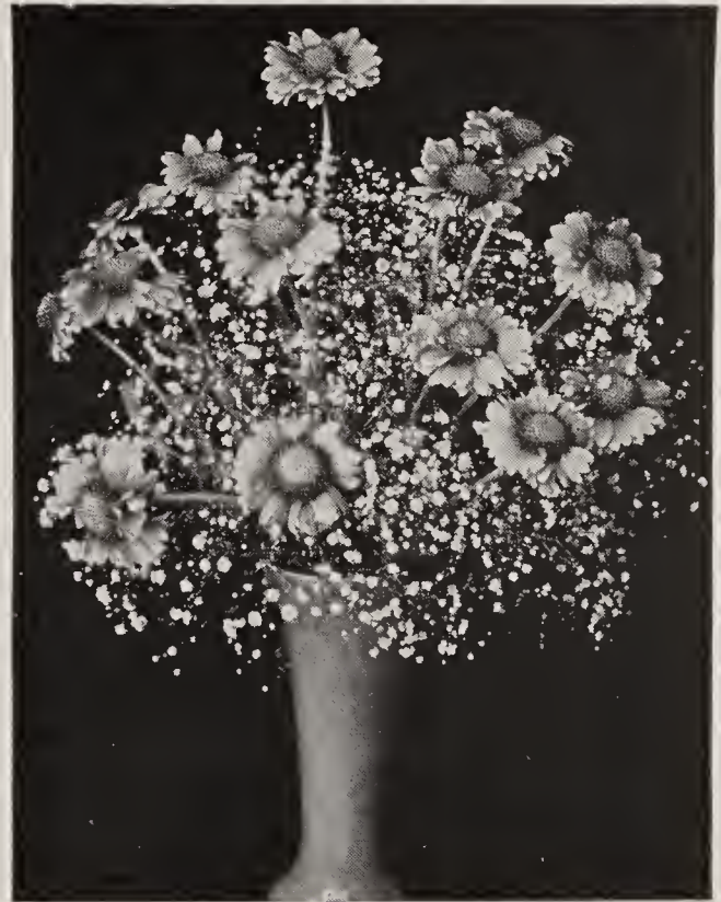
GAILLARDIA WITH GYPSOPHILA

Variegata. Variegated foliage, blue flowers. Beautiful edging plant. 25c. each, $1.80 per 10, $12.00 per 100.